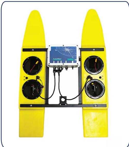
Hydrone With AutoNav Addition